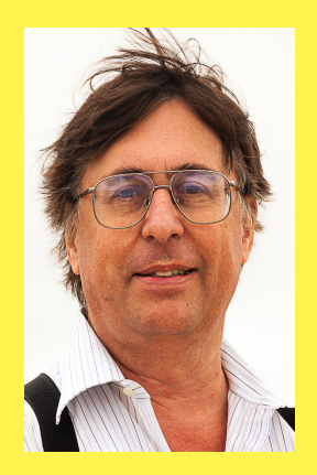
Figure: This is your instructor.

"Not" "If-Then" Contrapositive, Converse, and "Iff"