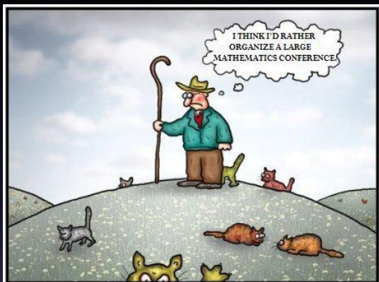
The daydreams of cat herders

(Modified from the Original Dr. Fun Comic)